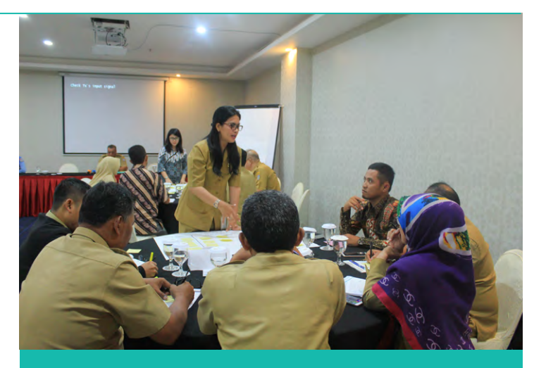
Participants at the City to province dialogue on climate action