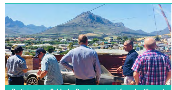
Participants in Saldanha Bay discussing informal settlement electrification