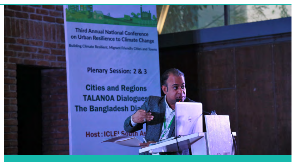
The Bangladesh Talanoa Dialogue in full flow

Stakeholders, including national and local government, attended an exciting dialogue to take stock of climate action and collaboration in Bangladesh. Some of the key lessons identified at the dialogue were building awareness, innovative finance and improving capacity building among all level of stakeholders. Read the Report and the full story here.