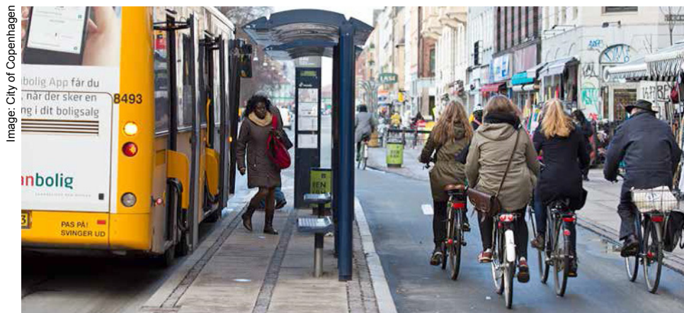
Bus stop by Assistentens Cemetery - January 2013

were coupled with regulations such as restricted car access in bus lanes and lower speed limits. By implementing measures in small increments, the City and its residents were able to assess the success of its interventions and determine their suitability for inclusion in the Plan's second stage.