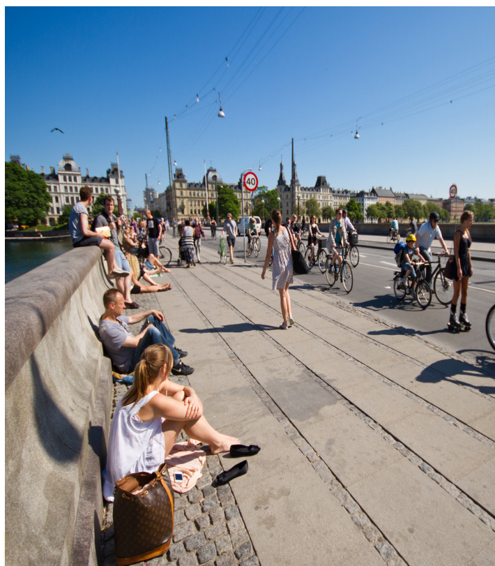
Expanded sidewalks and cycle lanes on Dronning Louises Bro.

The Urban-LEDS project, funded by the European Commission, and implemented by UN-Habitat and ICLEI, has the objective of enhancing the transition to low emission urban development in emerging economy countries by offering selected local governments in Brazil, India, Indonesia and South Africa a comprehensive methodological framework (the GreenClimateCities methodology) to integrate low-carbon strategies into all sectors of urban planning and development.