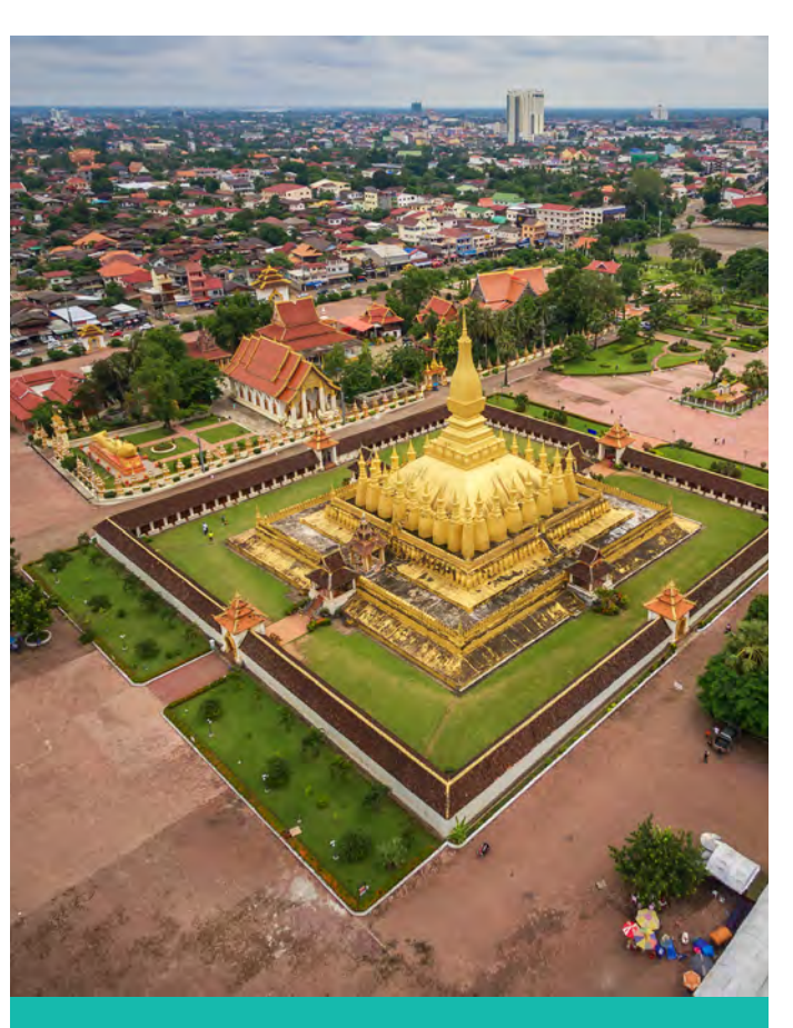
Aerial view of Vientiane, Lao PDR

In addition to that activity, the Vientiane Sustainable Urban Transport Project implemented by the Ministry of Public Works and Transport (MPWT) will help improve urban transport operations and capacity in Vientiane by establishing a transport management entity, high-quality bus services, and a bus rapid transit (BRT) system. The project promotes gender mainstreaming, greenhouse gas emissions reduction, and public-private partnerships. The project implementation started in August 2018 and is envisioned to be complete before the end of 2020.