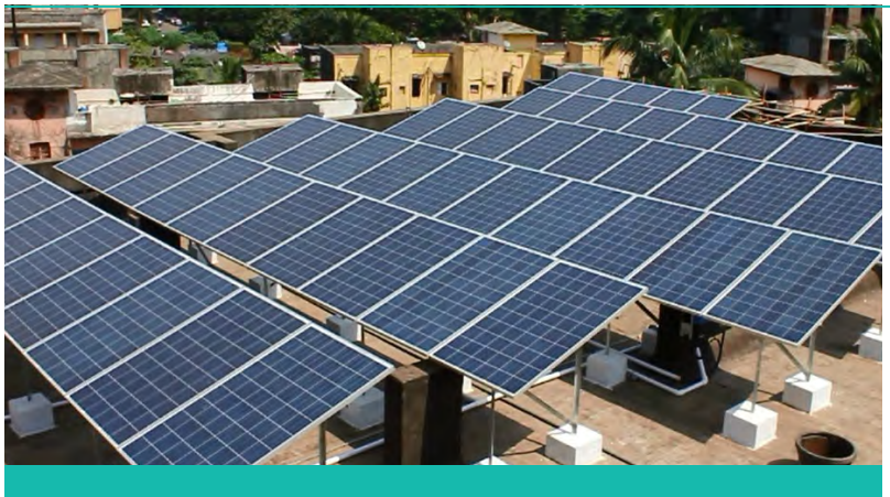
Solar PV System at municipal school in Thane

Envigado Antioquia (Colombia) landscape