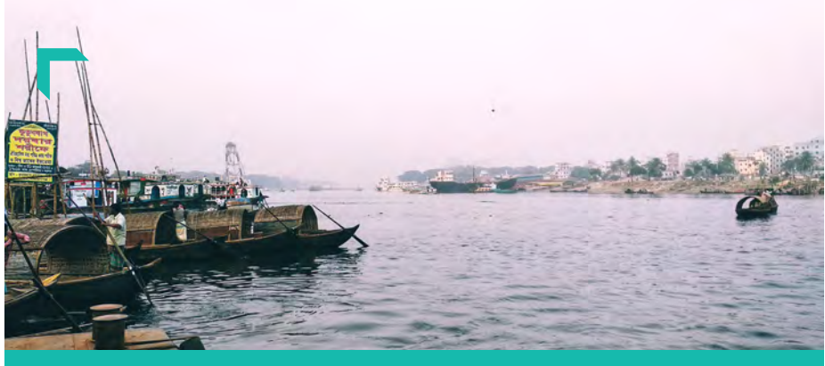
Bangladesh ferries used for commuting across Shitalakhya river in Narayanganj