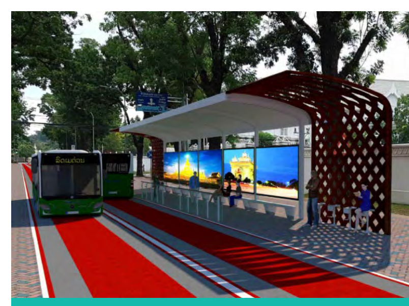
A model image of the Vientiane Sustainable Urban Transport Project by the Ministry of Public Works and Transport (MPWT) of Lao's People Democratic Republic (Lao PDR).

Recognizing the impact of climate change and the need to contribute to sustainable development, the Lao PDR Government recently endorsed a National Green Growth Strategy 2030. The Deputy Prime Minister, Mr. Somdy Douangdy, also serving as the Minister of Finance, said the government viewed the implementation of the National Green Growth Strategy as one of its priority tasks in line with its strategic priorities under the Eighth National Socio-Economic Development Plan. The strategy also aimed to help Lao PDR build its capacity to respond to climate change. The plan stresses the need to utilize the nation's natural resources more efficiently and taking a development path that is more resilient to risks brought about by climate change impacts, while also protecting public health.